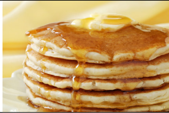
Pancakes with Maple Syrup (sirope de arce)